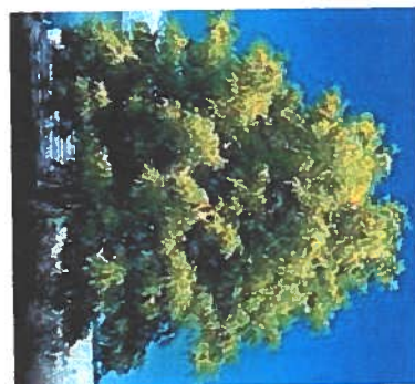
Honey Locust Gleditsia triacanthos