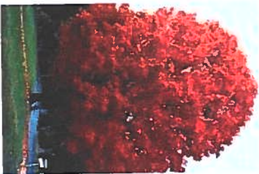
Sugar Maple Acer saccharum