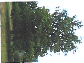
American Sycamore Platanus occidentalis