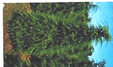
Eastern Hemlock Tsuga canadensis