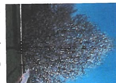
Flowering Pear Pyrus