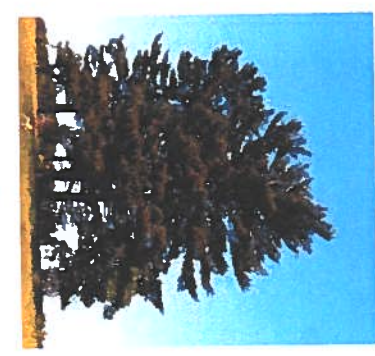
Eastern White Pine Pinus strobus