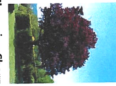
Flowering Cherry Prunus