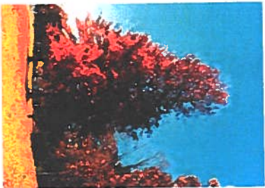
Red Oak Quercus rubra