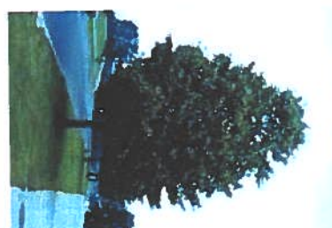
Little Leaf Linden Tilia cordata